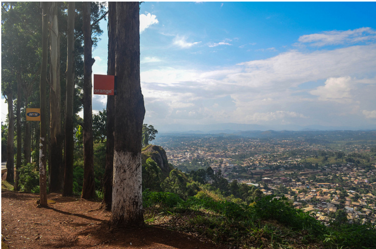
Bamenda, Cameroon.