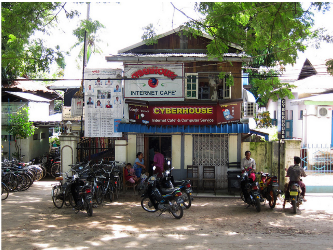
An Internet cafe in Pinyinana, Mandalay Region, Myanmar.