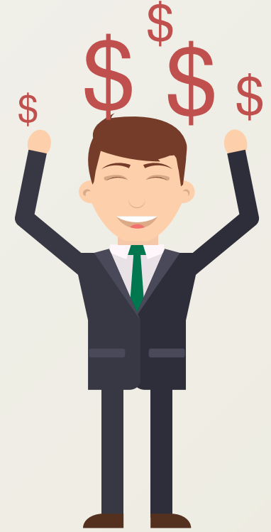
emerging socio economy in many form related to internet.