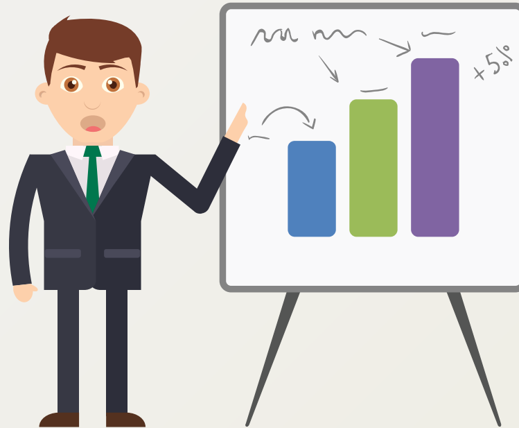
Increase diversification Internet usage outside social media.