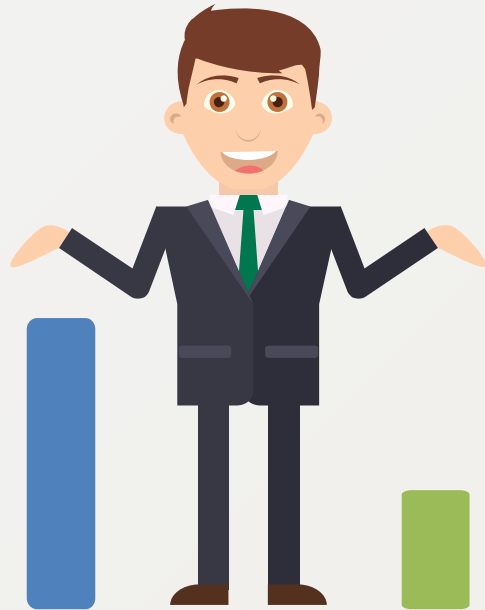
More free time