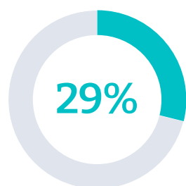
ONLINE POPULATION