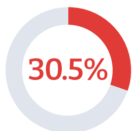
MOBILE BROADBAND PENETRATION