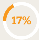
ESTIMATED TO HAVE 4G SPEEDS

NATIONAL ASSESSMENT FOR MEANINGFUL CONNECTIVITY (2021, BASED ON PILLARS' AVERAGE)