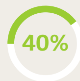
ESTIMATED TO OWN A SMARTPHONE