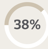
ESTIMATED TO HAVE DAILY INTERNET USE